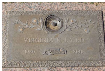
Grave markers